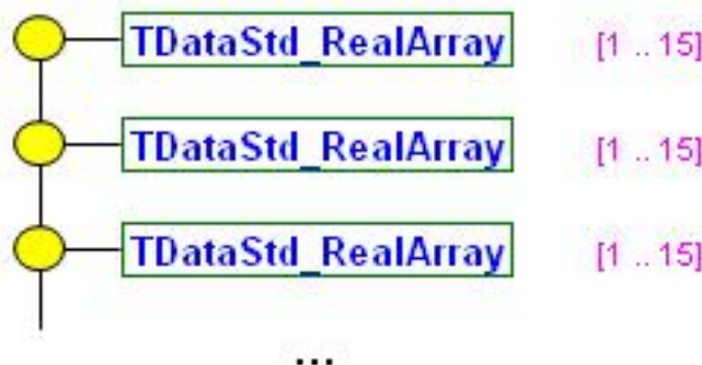
Figure 2: Allocation of data of each measurement point as arrays of double values

Let's consider the allocation of data of each measurement point per label (the second case). In this case we create 100 000 labels – one label for each measurement point and attach an array of double values to these labels: